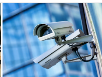
Electronic equipment, including computers, radio, surveillance, systems, and forensic tools