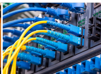
Computer servers and data storage devices