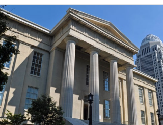
Buildings and contents